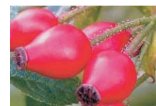
Rose Hip seeds

Contains pure vegetable oils of Olive, Wheatgerm, Sweet Almond, Argan, Borage and Rose Hip (Rosa Moschata); pure Spring water; pure Lemon juice; pure essential oils of Ylang ylang, Lemon Balm and Geranium; natural vitamin "E".